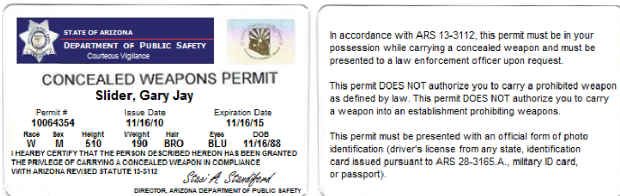
This image has been digitally assembled from another image/s. It may not be 100% accurate but gives a good representation of the actual Permit/License