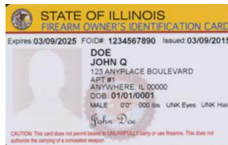
Front of New FOID Card 3/15