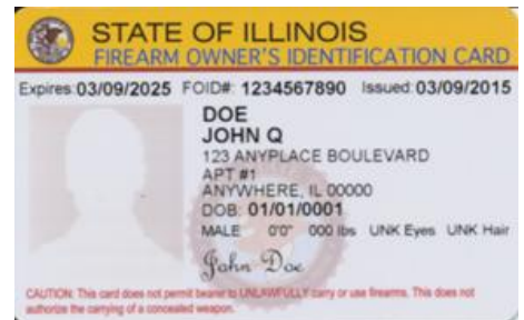
Front of New FOID Card 3/15