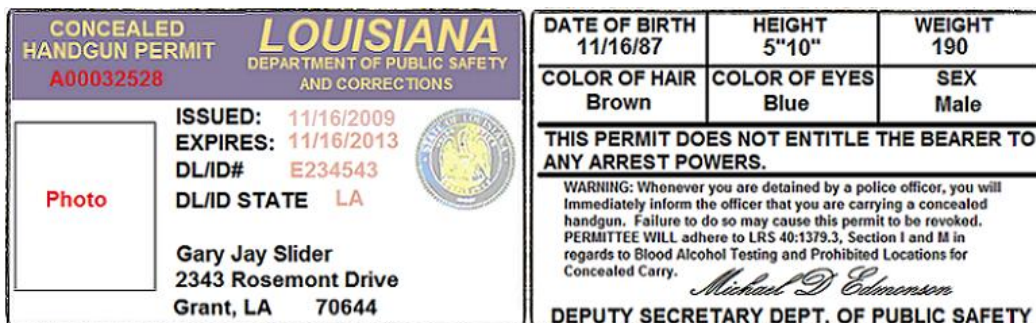
This image has been digitally assembled from 2 or more images. It may not be 100% accurate but gives a good representation of the actual Permit/License.