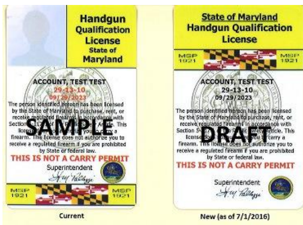
Handgun Qualification License needed to buy handguns and SBR & SBS. Good for 10 years. Showing Old & New Versions.