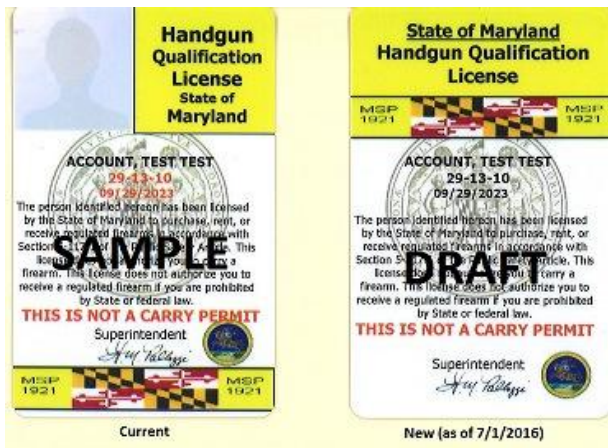
Handgun Qualification License needed to buy handguns and SBR & SBS. Good for 10 years. Showing Old & New Versions.