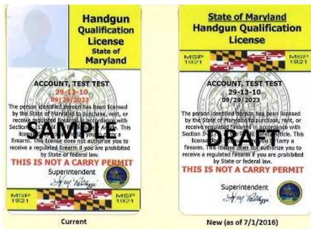
Handgun Qualification License needed to buy handguns and SBR & SBS. Good for 10 years. Showing Old & New Versions.