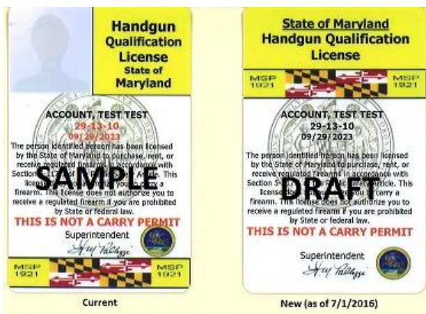
Handgun Qualification License needed to buy handguns and SBR & SBS. Good for 10 years. Showing Old & New Versions.