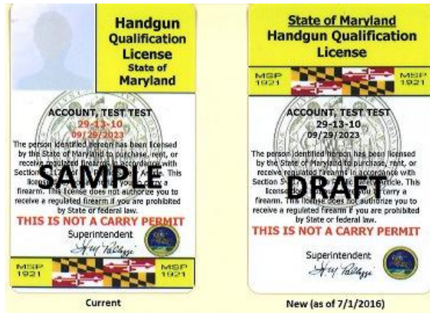
Handgun Qualification License needed to buy handguns and SBR & SBS. Good for 10 years. Showing Old & New Versions.