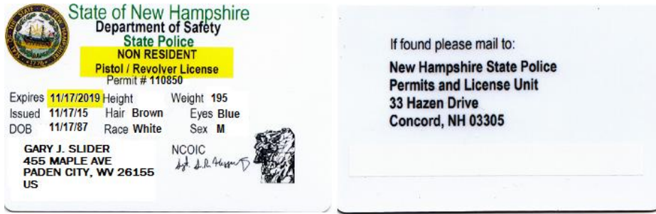
New Non-Resident Permit Format