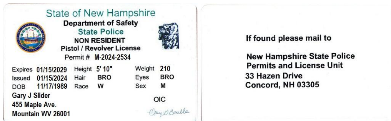
New Non-Resident Permit Format 2024.

These images has been digitally assembled from 2 or more images. They may not be 100% accurate but gives a good representation of the actual Permit/License