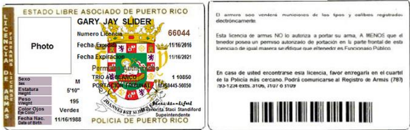
Tiro Al Blanco means Target Shooting, Portacion Tribunal Means Carry Court.

This Image has been digitally assembled from 2 or more images. It may not be 100% accurate but gives a good representation of the actual Permit/License.