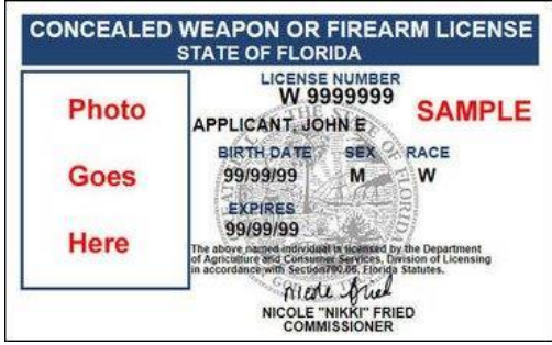
Florida has now removed the issue date from their License (May 2019)

The FL Resident & Non-Resident Licenses look exactly the same. FL no longer puts an address on their issued Licenses to Carry.