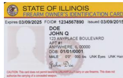
Front of FOID Card 3/15

Visit the Illinois State Police website at www.isp.state.il.us or 430 ILCS 66 for further information. ILLINOIS LAW REQUIRES YOU TO CARRY YOUR CONCEALED CARRY LICENSE AT ALL TIMES WHEN CARRYING A CONCEALED FIREARM EXCEPT: When the licensee is carrying or possessing a concealed firearm on his or her land or in his or her abode, legal dwelling, or fixed place of business, or on the land or in the legal dwelling of another person as an invitee with the person's permission. When the person is authorized to carry a firearm under Section 24-2 of the Criminal Code of 2012, except subsection (a-5) of that Section. When the handgun is broken down in a non-functioning state, is not immediately accessible, or is unloaded and enclosed in a case.