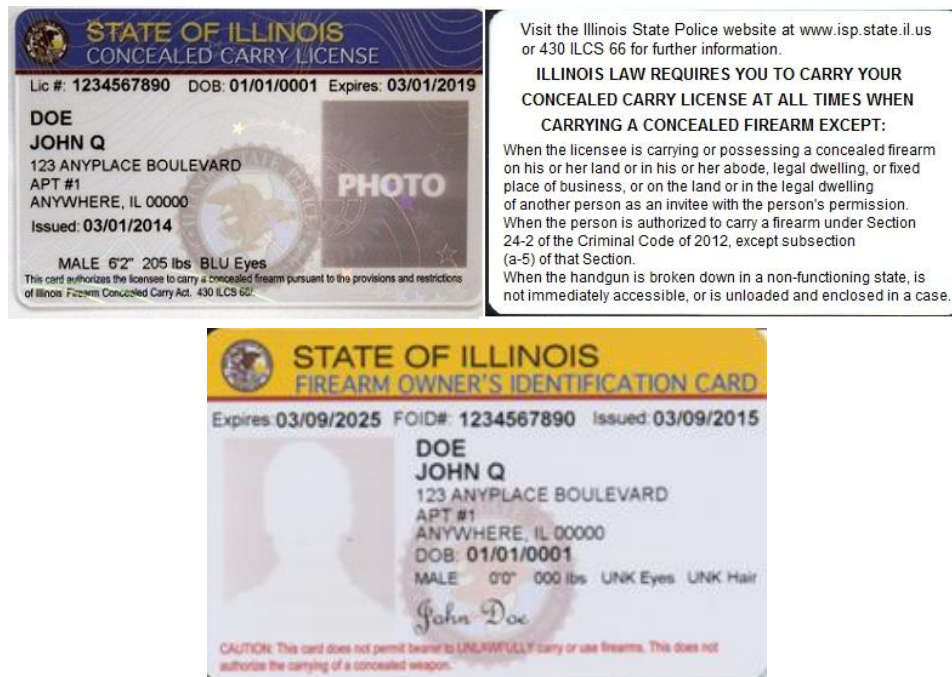
Front of New FOID Card 3/15