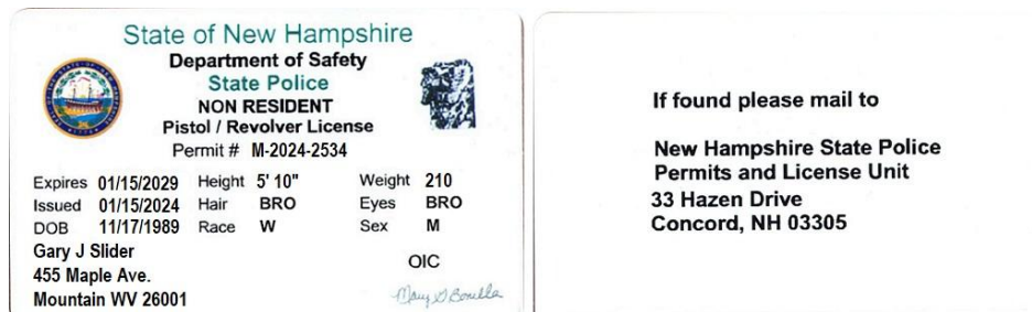
New Non-Resident Permit Format 2024.

These images has been digitally assembled from 2 or more images. They may not be 100% accurate but gives a good representation of the actual Permit/License