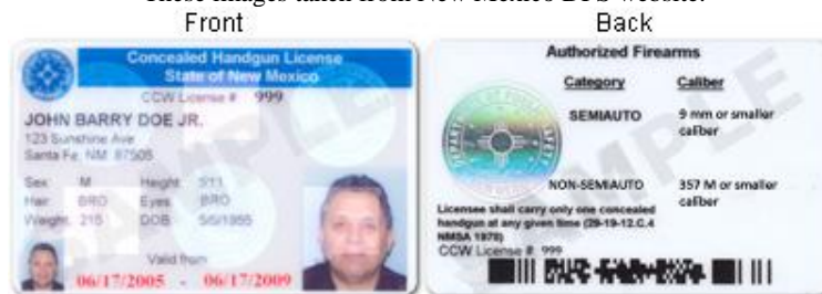
New version with Non Semi Auto taking the place of Revolver.